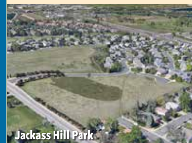
Jackass Hill Park