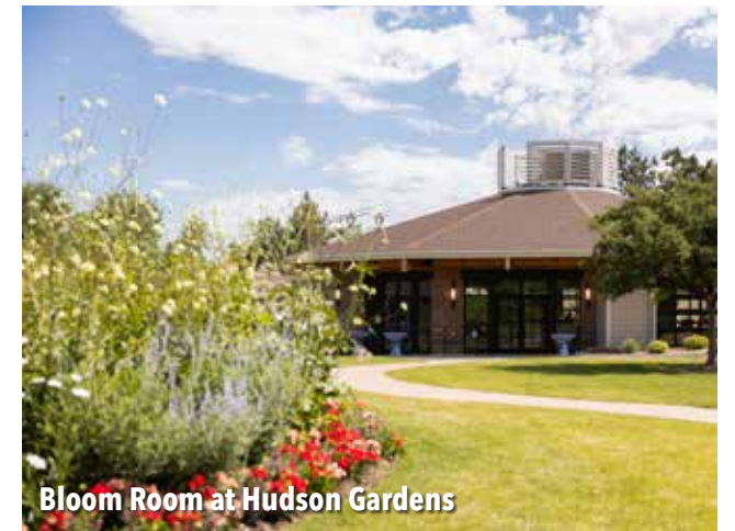
Bloom Room at Hudson Gardens