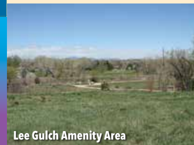
Lee Gulch Amenity Area

Colorado Journey: Out with the old and in with the new at Colorado Journey Miniature Golf. Crews have been working hard to replace turf on all 36 holes, pumps for new water features and a new PA system. Upgrades will be complete by late spring 2024.