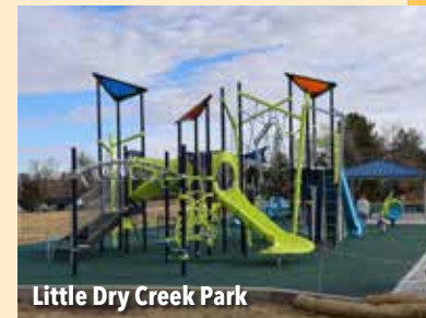
Little Dry Creek Park