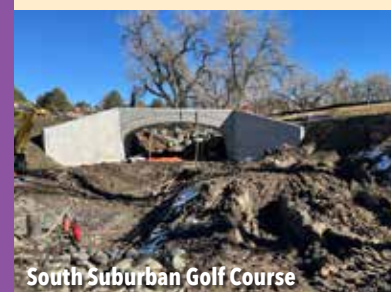
South Suburban Golf Course