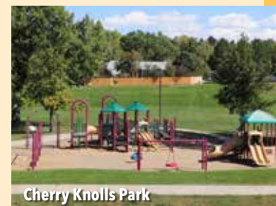
Cherry Knolls Park